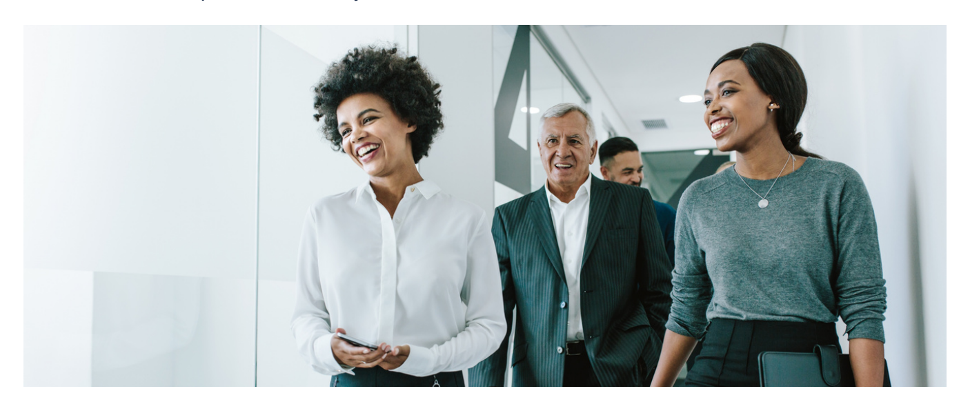
A photo of the team

A business proposal is a written offer from a seller to a prospective client or investor. Business proposals are often a critical step in the complex sales process. A proposal ultimately tells the buyer about the seller's capabilities to satisfy their needs.